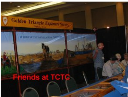
Friends at TCTC