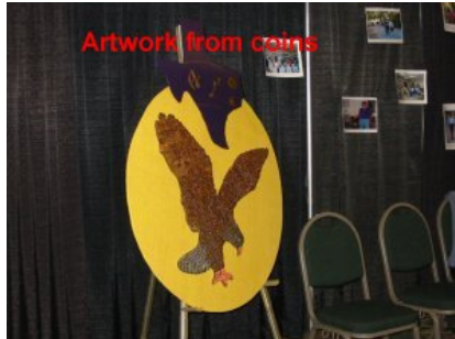
Artwork from coins