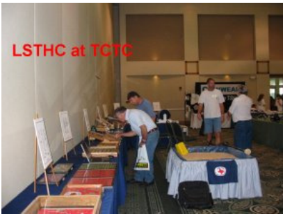
LSTHC at TCTC