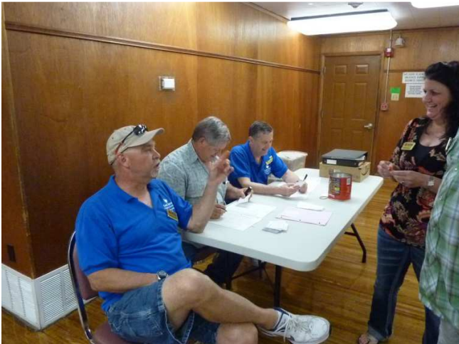
Our chief cook and FOM tally committee