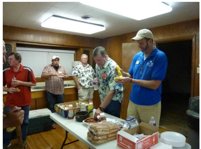
Dogs and chips