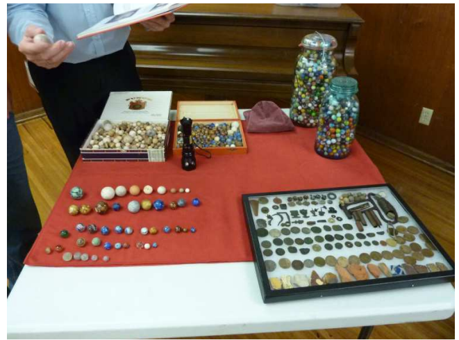
Rusty's marble displays