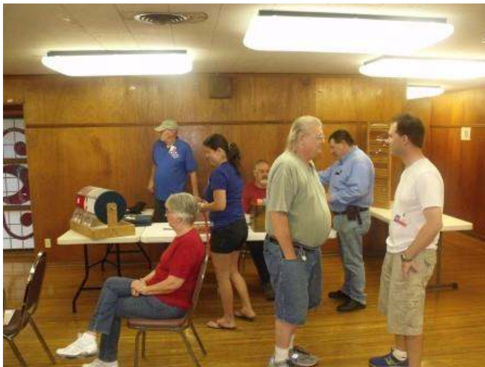
The Raffle Corner